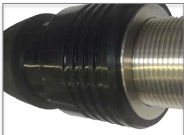
When properly installed ½" DIN Male WPS should completely cover the WPS-DF-T grooves.