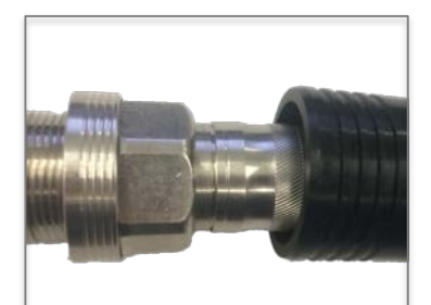
Properly installed WPS-DF-T to connector.